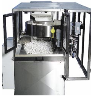
End view. Easy for loading bottles.