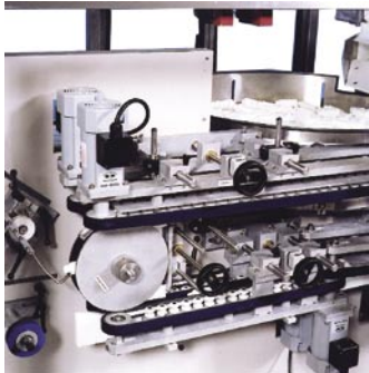
Non-scuffing nylon faced padded transfer belts