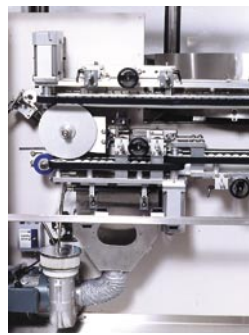
Optional ionized air rinsing