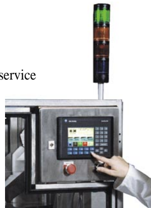
Optional Allen-Bradley® touch panel shown