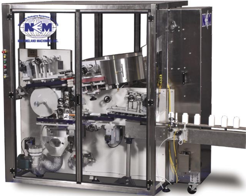
NEHCP-36 compact unscrambler w/ optional ionized air rinser

The New England Machinery, Inc. NEHCP-36 is a compact unscrambling system. This model offers a compact, space saving footprint due to an integrated hopper elevator. The NEHCP-36 is designed for high efficiency and high output.