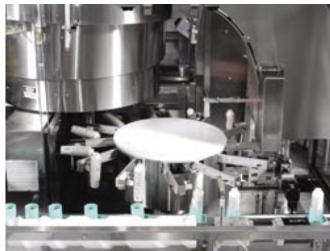
Close-up of rotary beltless unscrambling area and optional integrated pucking system