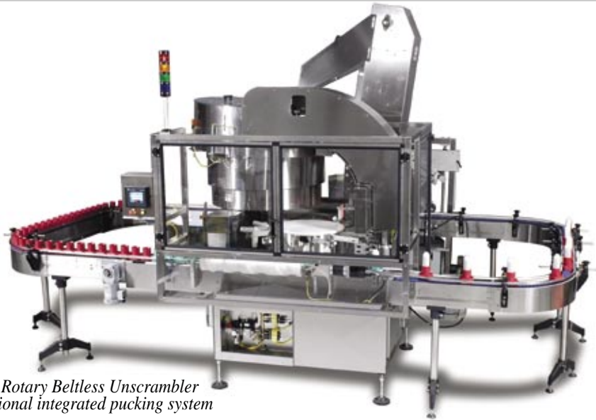
NERBU Rotary Beltless Unscrambler with optional integrated pucking system

The New England Machinery Model NERBU is a Rotary Beltless Unscrambler. This unscrambler offers a uniquely designed adjustable sorting bowl, adjustable container chute, and adjustable container transport stations. The bowl is designed without intrusive structures in the bowl to impede the container sorting process. The equipment is offered with optional automated changeover via touch screen menu selection.